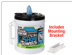
Z400 BIG GRIP® Dispenser of Shop Towels