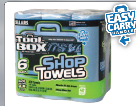
Z400 Roll of Shop Towels 6PK