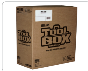
Z400 Interfold Outer Case