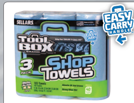
Z400 Roll of Shop Towels 3PK