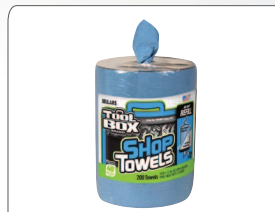
Z400 BIG GRIP® Refill of Shop Towels