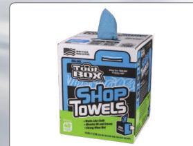
Z400 Box of Center-Pull Shop Towels