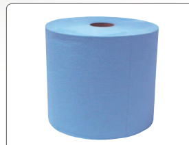
Z400 Jumbo Roll of Shop Towels