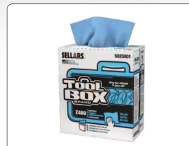
Z400 Interfold Shop Towels