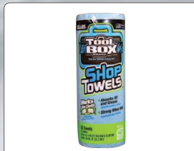
Z400 Roll of Shop Towels

Made With 40% Post-Consumer Recycled Fibers*