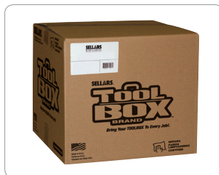
Z300 GREENX™ Series Jumbo Roll Outer Case

*WYPALL is a registered trademark of Kimberly-Clark Worldwide Inc.