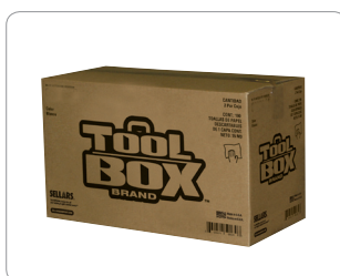
Z300 GREENX™ Series Big Grip® Bucket Outer Case

*WYPALL is a registered trademark of Kimberly-Clark Worldwide Inc.