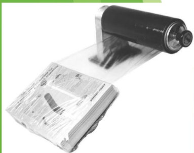
Table mount Bundler, engineered for permanent stretch bundling. Built-in Stretch Set™ feature allows precise control of film stretch. Sturdy zinc die cast construction will accept handwrap and machine rolls to 10" diameter.