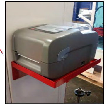
Optional Printer Package