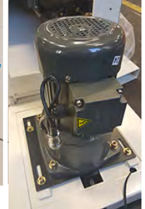
1HP Electric Motor