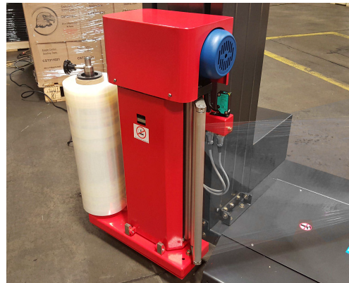
Film Carriage Assembly