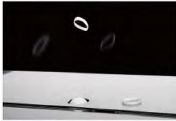
Auto Loop Ejector