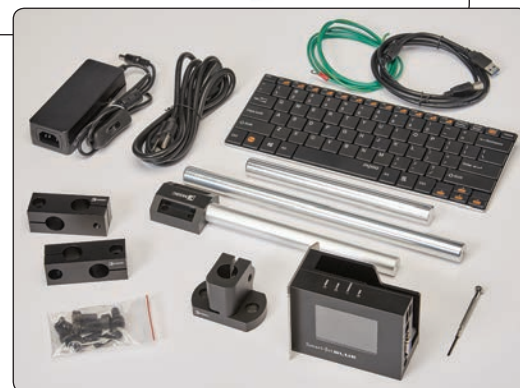
Pieces included in package