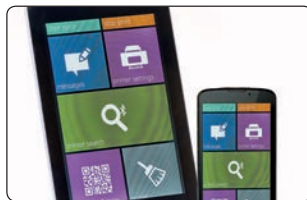
App works on Android devices