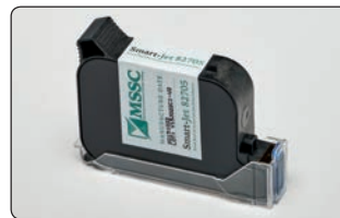
TIJ cartridge technology