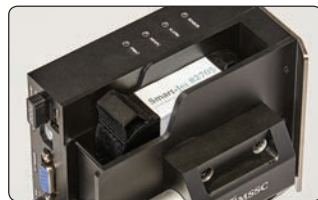
Redesigned Printer Head